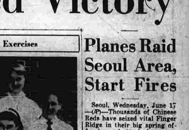
These students made up the panel of speakers who delivered short orations on the 251 eighth graders at Bernard School in the Vernal Beach school building.