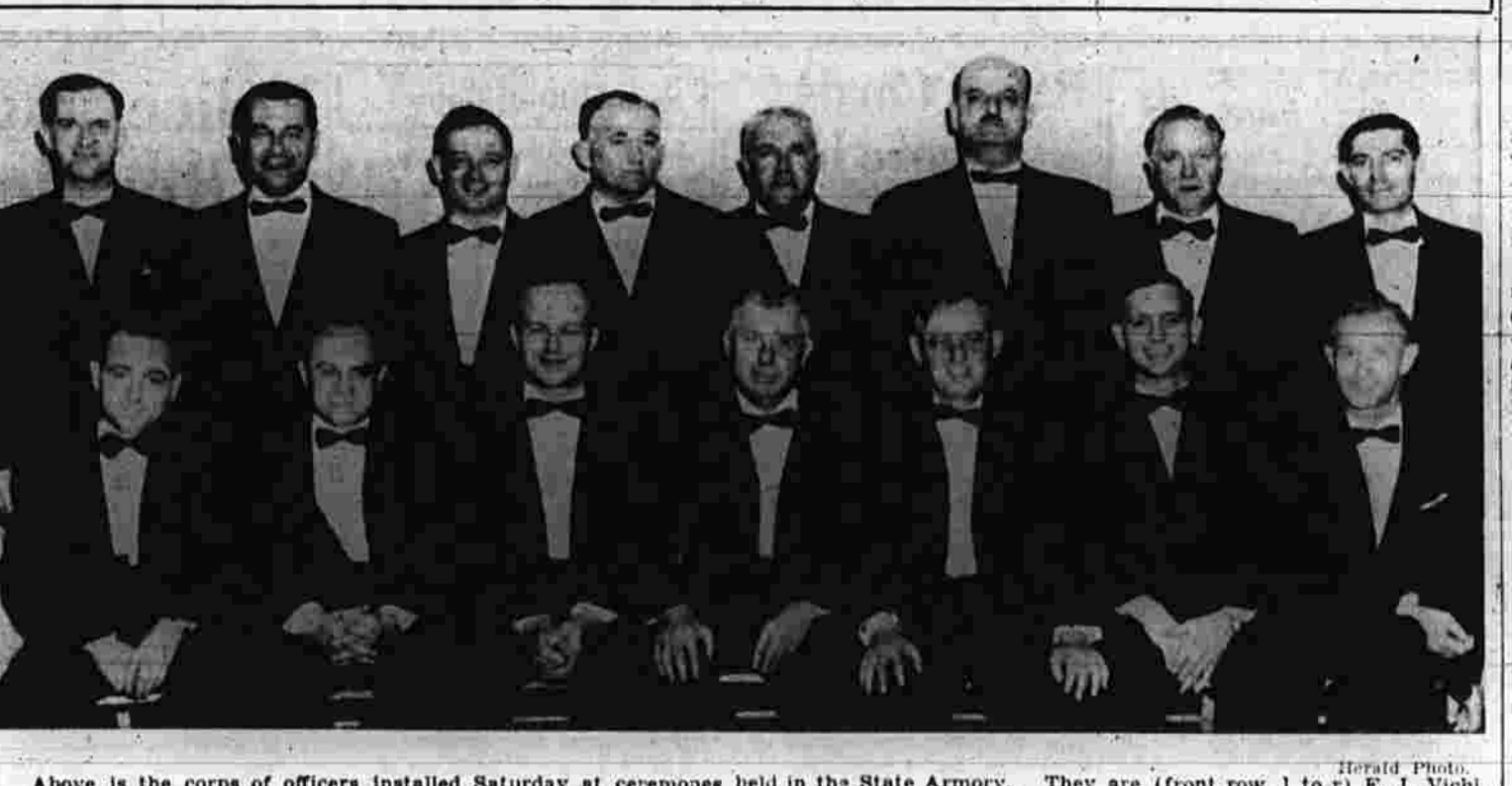
Above is the corps of officers installed Saturday at ceremonies held in the State Armory...